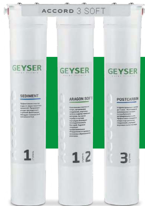
ACCORD 3 SOFT

As part of the ARAGON SOFT – combined cartridge for complete purification