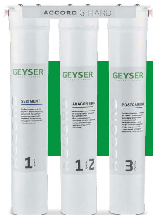
ACCORD 3 HARD

As part of the ARAGON NRG – combined cartridge for complete purification